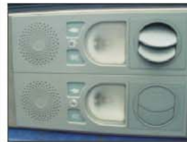
Individual reading lights & ventilation.