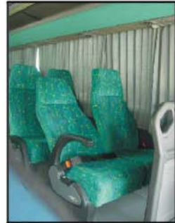
Spacious, comfortable seating