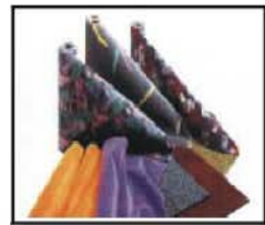
A selection of fabric options to chose from